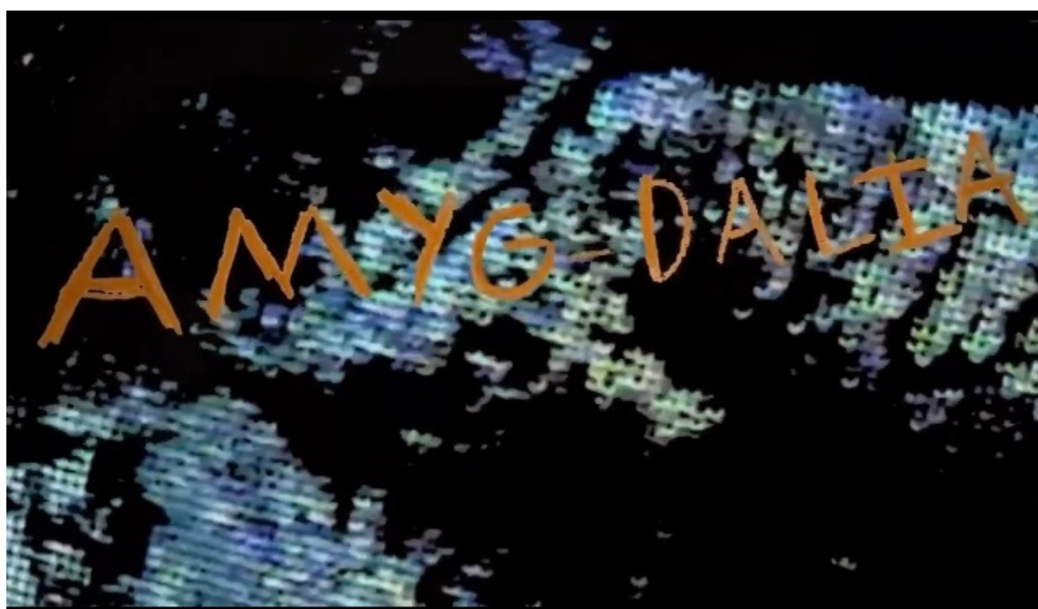
Still frame of animated short film, "Amygdalia"