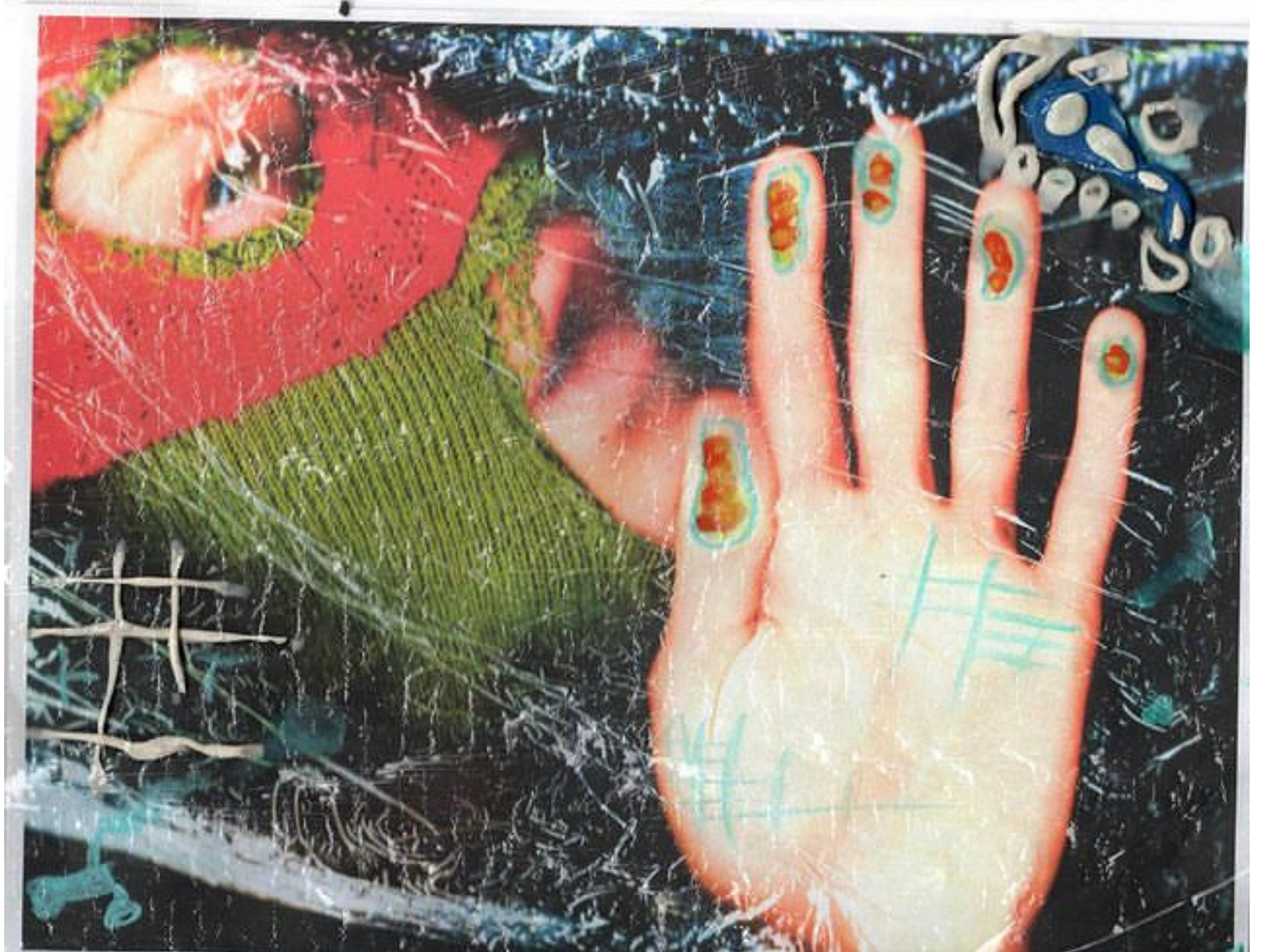
"Scangirl" Manipulated scanned image